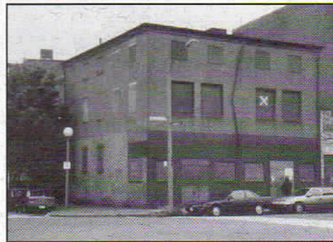
PORTER HOUSES BEFORE FIRE

ON THE NIGHT OF MAY 23, a three-alarm fire broke out in the Porter Houses at the corner of East Springfield and Washington Streets. The oldest structures in the South End, the Porter Houses date to circa 1806 and display elegant Federal architectural details, inside and out. The property is currently owned by the Boston