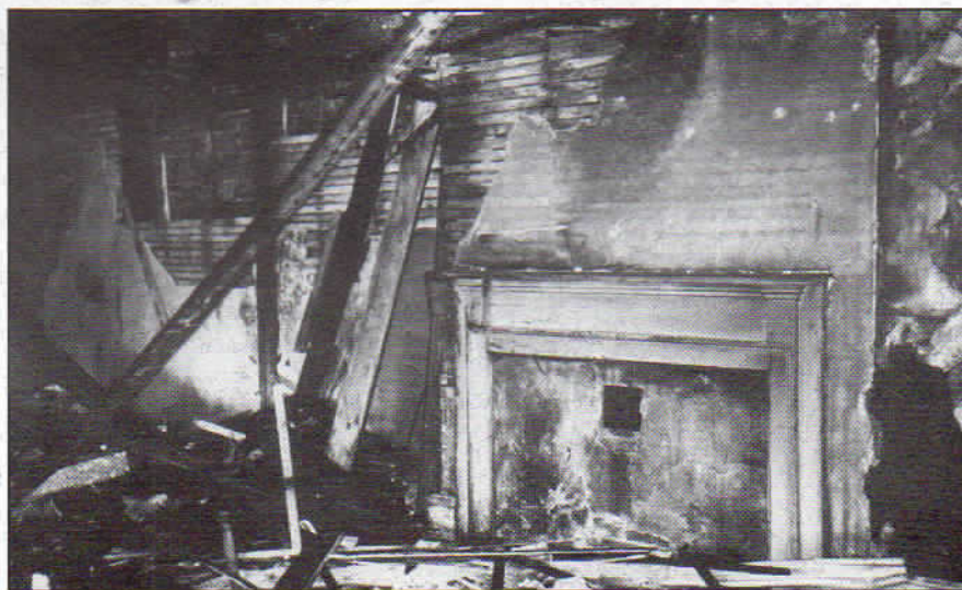
SCORCHED DEBRIS LEFT AT THE PORTER HOUSES AFTER THE FIRE

The South End Historical Society Celebrates its 28th Year