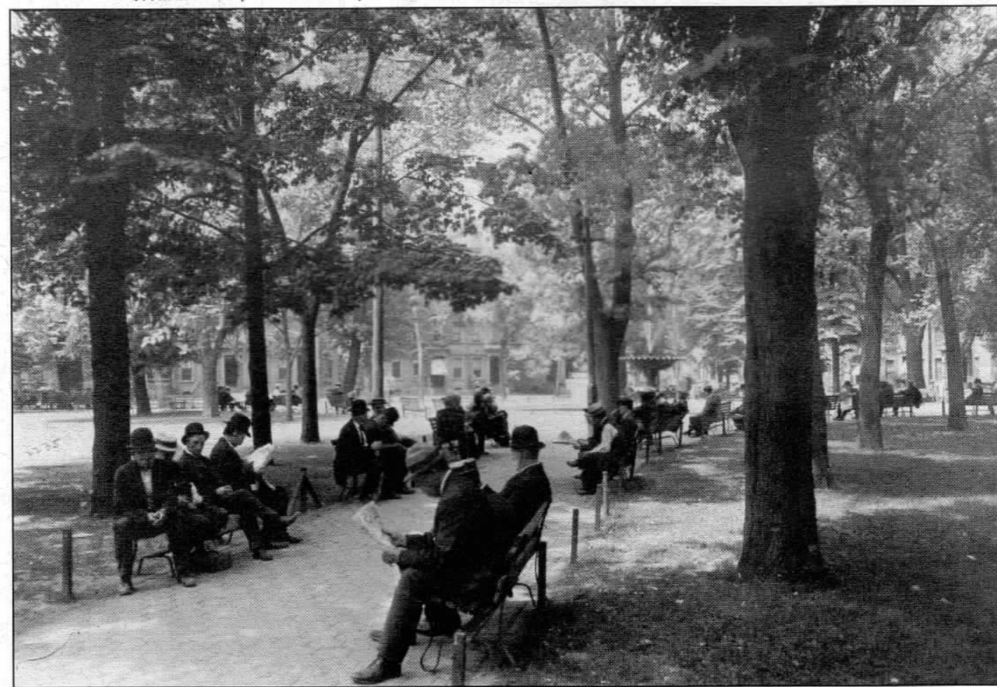
SOUTH ENDERS ENJOY BLACKSTONE SQUARE IN THE 1920S.

This newsletter is published by The South End Historical Society, 532 Massachusetts Avenue, Boston, MA, 02118; office telephone (617) 536-4445. The opinions expressed by the contributors are not necessarily those of The Historical Society. Every effort will be made to return unsolicited manuscripts submitted for possible publication if accompanied by a self-addressed, stamped envelope. Those interested in printing articles must obtain written permission from the editor. Copyright, The South End Historical Society, Inc.