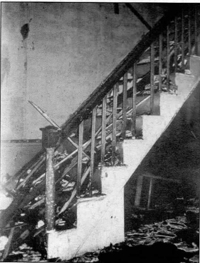
CHARRED STAIRCASE AT THE PORTER HOUSES.

Many residents approached me on the street the next day to ask if I knew that the Porter Houses were the oldest structures in the South End—illustrating their importance to the neighborhood. Stay tuned for more developments.