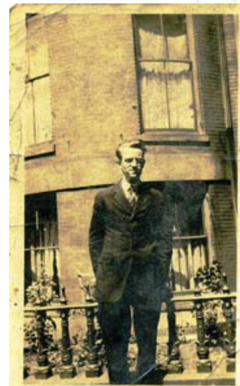
Unknown South End man

The SEHS would also like to thank the Aertsen-Blair family for donating over one hundred photographs that depict the lives of a former West Brookline Street family. Found in the Aertsen home, these photographs were left behind by the previous occupants when they left the South End in 1975. The images date from between the 1890s and the 1940s (approximately) and many were taken by professional photographers in South End and Boston photograph studios. In addition, while we researched the photographs, we learned about the family that lived in the house before the family in the photographs. This second family, the Taylor Family (the brother of the founder of the Boston Globe) has living descendants in the Boston area. We contacted them and found that two descendants remember living on West Brookline Street from the early to mid- twentieth century. The Bonner family generously allowed us to