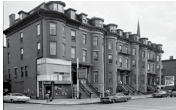
Image from the 1972 South End Streets Survey

If you are interested in reproducing a SEHS image for personal, commercial, or research purposes, please contact us at 617-536-4445 or admin@southendhistoricalsociety.org for more information about our image collection, fees, and policies.