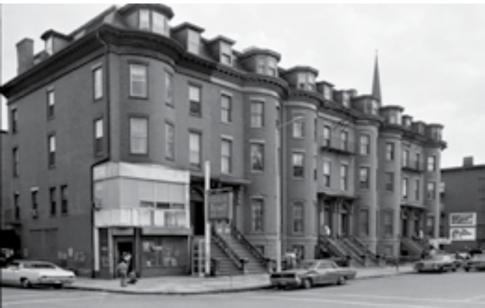
Image from the 1972 South End Streets Survey

If you are interested in reproducing a SEHS image for personal, commercial, or research purposes, please contact us at 617-536-4445 or admin@southendhistoricalsociety.org for more information about our image collection, fees, and policies.