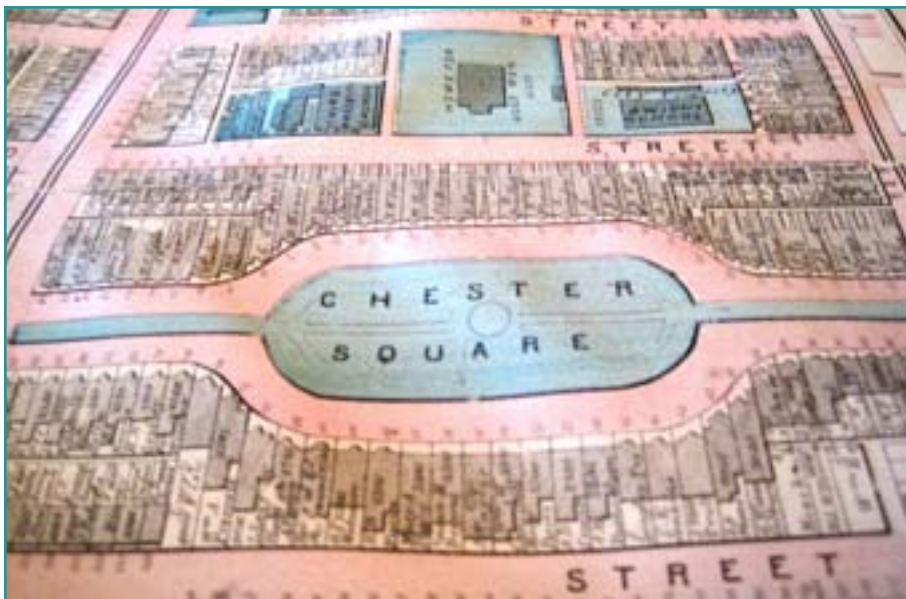
Ward Map, Chester Square, Card Collection