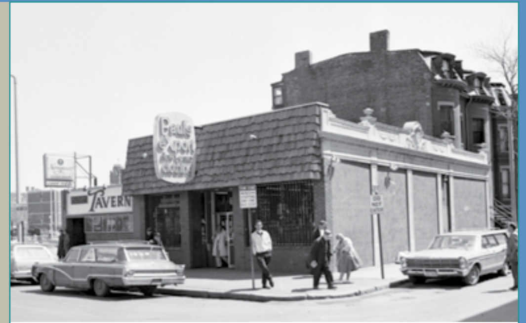
512-518 Tremont Street.