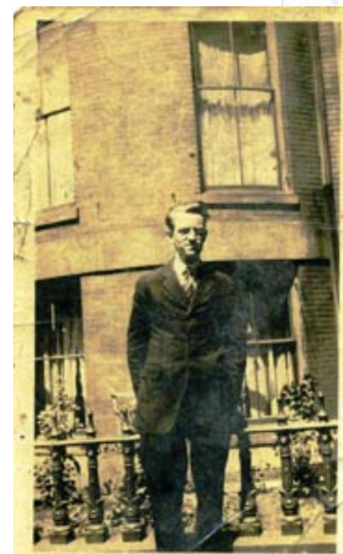
Unknown South End man