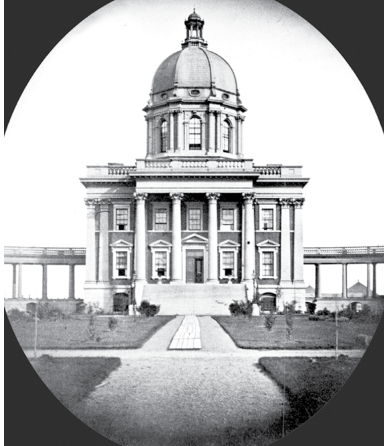
Boston City Hospital main facade, late nineteenth century