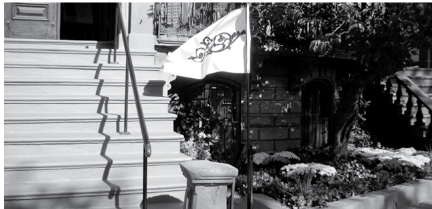
536 Massachusetts Avenue

THANK YOU TO EVERYONE WHO SUPPORTED OUR 42ND Annual House Tour. We exceeded our goal and could not have done it without your participation. Please visit our sponsors, listed on our website at www.southendhistoricalsociety.org/programs . A special thank you to Shambalai Landscapes for making our front garden look beautiful for the tour. They can be reached at (781) 894-1183, email: Shambalai.landscapes@verizon.net . A special thank you as well to C.A.D. Commonwealth Services, Inc. for painting our front stoop for the tour. They can be reached at (617) 795-7077.