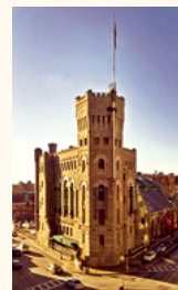
Park Plaza Castle, Boston