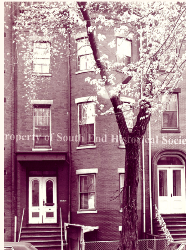
39 East Springfield in 1972