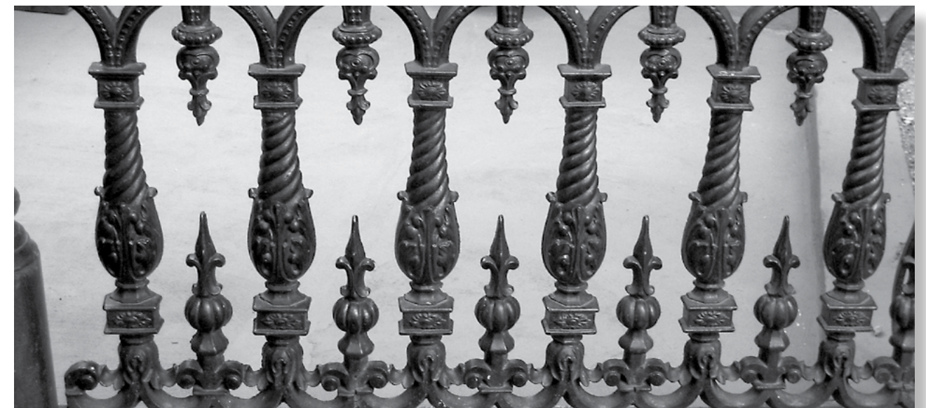
Renaissance revival style